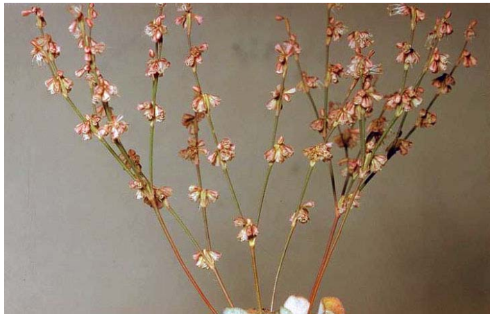
Coville's buckwheat ( Eriogonum covilleanum )