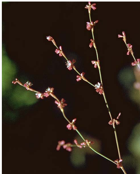
Ear-shaped buckwheat ( Eriogonum luteolum var. luteolum )