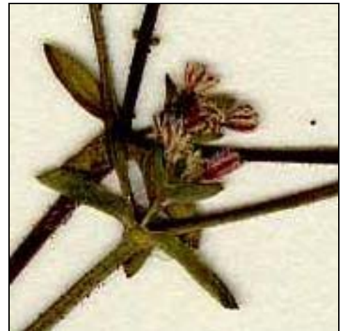
Unarmed buckwheat ( Eriogonum inerme )