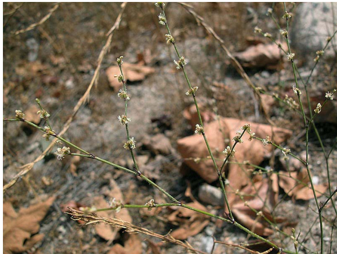
Slender woolly buckwheat ( Eriogonum gracile )