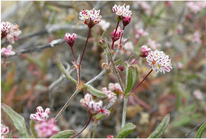
Anglestem buckwheat ( Eriogonum angulosum )