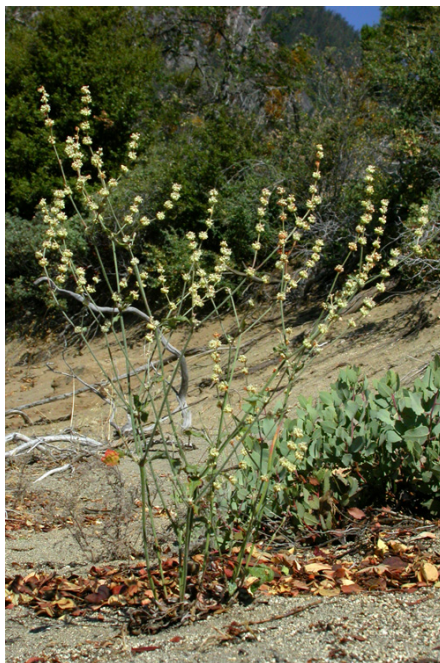
Wand buckwheat ( Eriogonum roseum )